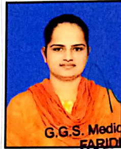
Principal G.G.S. Medical College FARIDKOT.