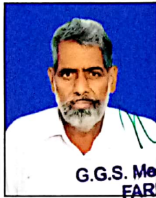
Principal G.G.S. Medical College FARIDKOT.