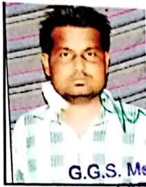
Principal G.G.S. Medical College FARIDKOT.