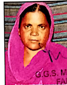
Principal G.G.S. Medical College FARIDKOT.