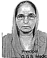
Principal G.G.S. Medical College Faridkot